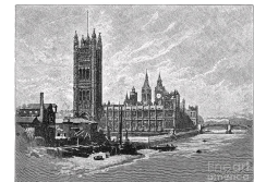
House of Parliament