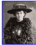
Emily Wilding Davison